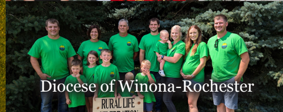
Diocese of Winona-Rochester