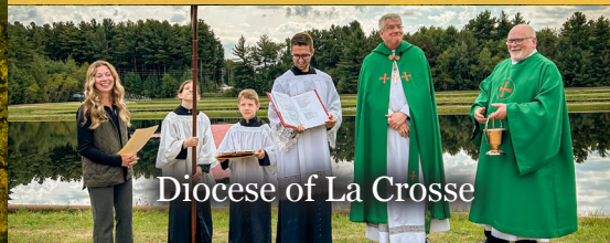
Diocese of La Crosse