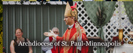
Archdiocese of St. Paul-Minneapolis