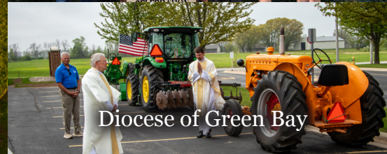
Diocese of Green Bay